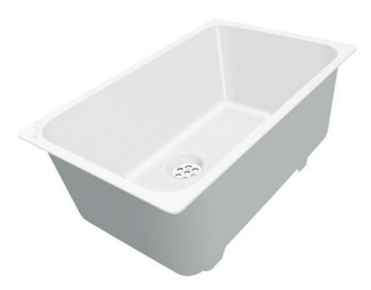
White bowl 8153 100