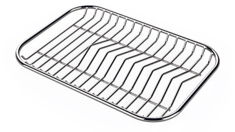
Stainless steel plate rack 8100 154