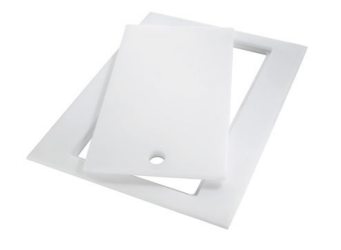
HPDE Twin chopping board 8644 101